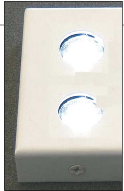
Pictured Model #: PKx2-WH-WH-WH +Z Call for Custom colors and voltages